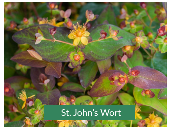
St. John's Wort