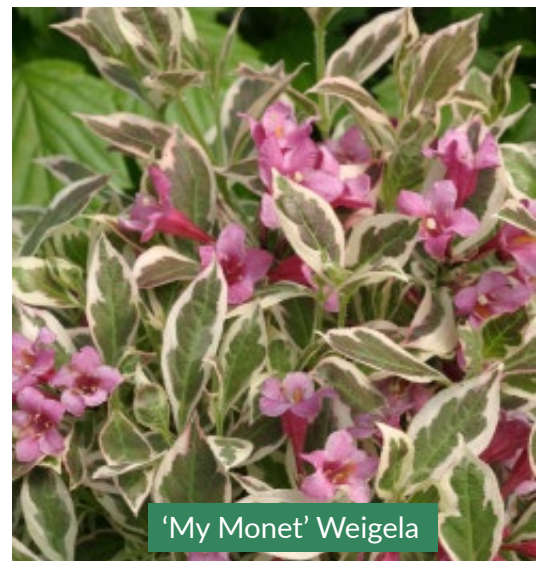
'My Monet' Weigela